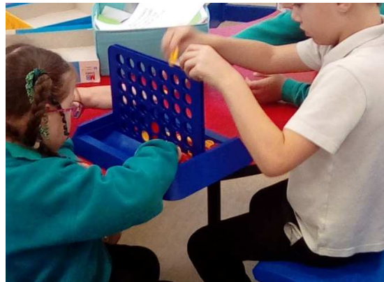
Room 5 are good at sharing and taking turns.