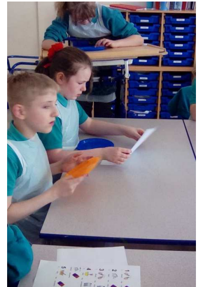
Room 7 have been following instructions during a cooking session.