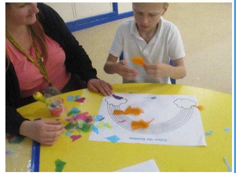
Lucas enjoyed making a collage with different coloured tissue paper.