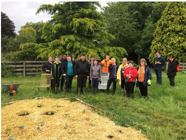
Room 11 have planted spaghetti squash, Romanesco cauliflowers and purple sprouting broccoli at Mere Brow Farm. They also added a few leeks for good measure.