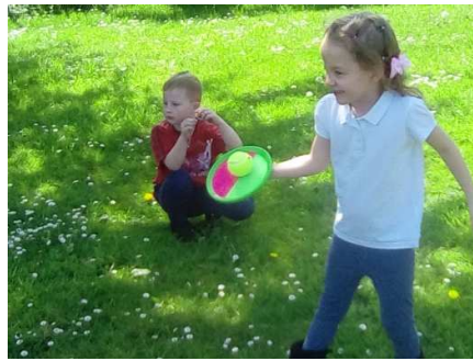
Outdoor play in room 1 was lots of fun.