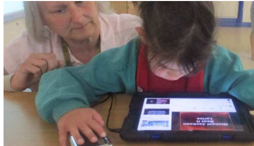
Room 4 explored sounds using a Wowee speaker and an ipad.