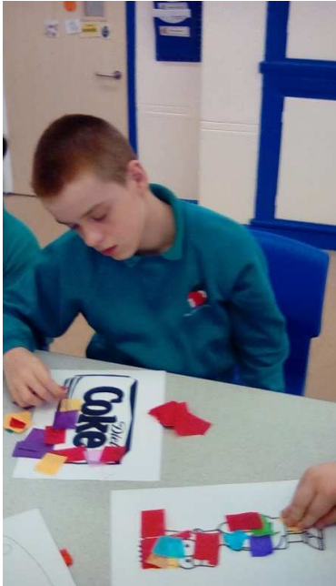
Room 7's art work is inspired by Andy Warhol.