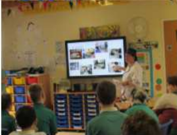
National Careers Week has been a huge success