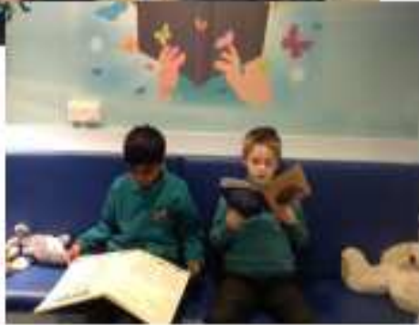
Pupils enjoyed World Book Day