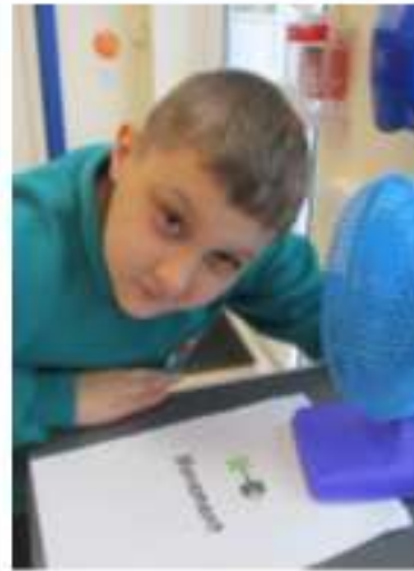
Room 6 have been busy in science this week