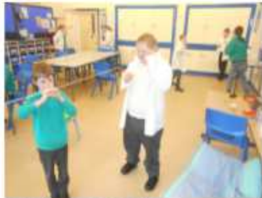
Room 7 have been exploring sound waves