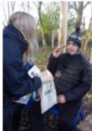
Room 10 had lots of fun at Forest School